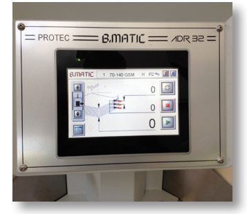
WIDE TOUCH SCREEN HD 7"