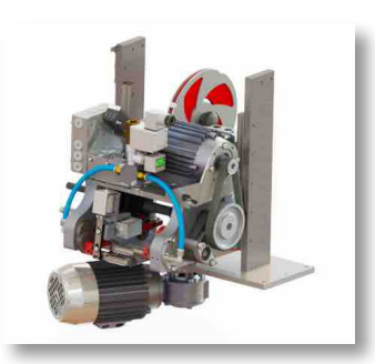
ADR 32 COUNTING HEAD AT 3000 SHEETS/MIN