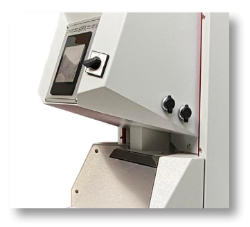
USB AND ETHERNET INTERFACE