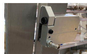
Clamp with sensor

This device is a useful tool that allows you to notify the operator when the magazine is about to end. Height adjustment is done via a sturdy clamp with lever.