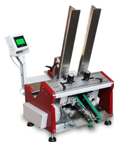
F350 Counter S Model